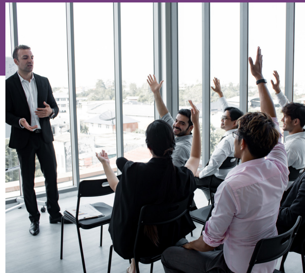
Case Study #5 Niche Tech Staffing

Summary: Raising awareness on 4.5 and 5G technology among senior engineers and C-suite executives of leading Southeast Asian telecom companies. The program specially covered network redeployment in New Radio, new towers, and backhaul fibre optics.